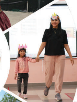
Parent - child interactive events