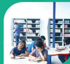
A comprehensive Library equipped with a wide range of books