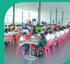
FSSAI certified cafe with planned and nutritious meals