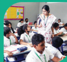
24/7 CCTV surveillance