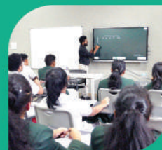
Fully air conditioned Interactive Smart Classrooms