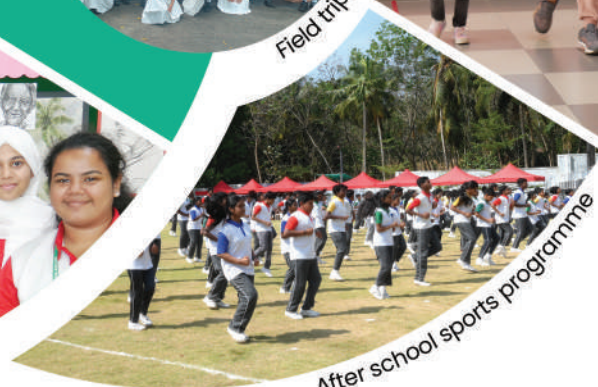
After school sports programme